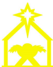
To Know Him

The church offices will be closed on December 25 th & 26 th for Christmas and January 1 st for New Years.