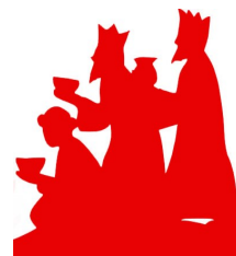
To Share His Love